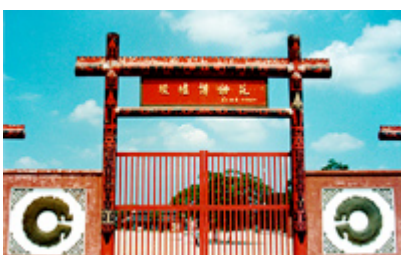
The Entrance of Yin Ruins

Yin Ruins, the capital city of late Shang dynasty, is the first capital ruins having the historic record and reconfirmed by oracle and archaeological excavations. It is located in the north suburb of Anyang, one of the China's historical and cultural cities, and scattered by the banks of Huan River. Yin Ruins has a history over 3300 years. Since 1300 BC emperor Pangeng moved the capital to Yin till the year 1046 BC, here remained as Shang dynasty's center of politics, economy, military and culture for 255