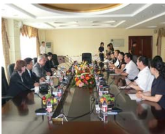
Anyang Forum at Anyang Zhenyuan Group Co., Ltd. on July 4 th 2007

Please visit our websites at http://www.sbccentre.com/ for more detailed information (Source: Sino-Canadian Business Center)