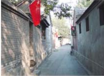
A glimpse of Old Beijing Alley

Beijing alley tour started 11 years ago. Nowadays, it received more than 170 thousand tourists every year. As a traditional city tour project, old Beijing alley tour naturally attracts lots of tourists. Blue sky, bright sunshine, simple and virtuous residents, Chinese quadrangle and alley – all these form the unique Old Beijing culture. In alley, you can see that old people hold palm-leaf fan to play chess and children chase each other. The real good food flavor could drive you to the right kitchen. Alley tour is always foreigners' favorite program.